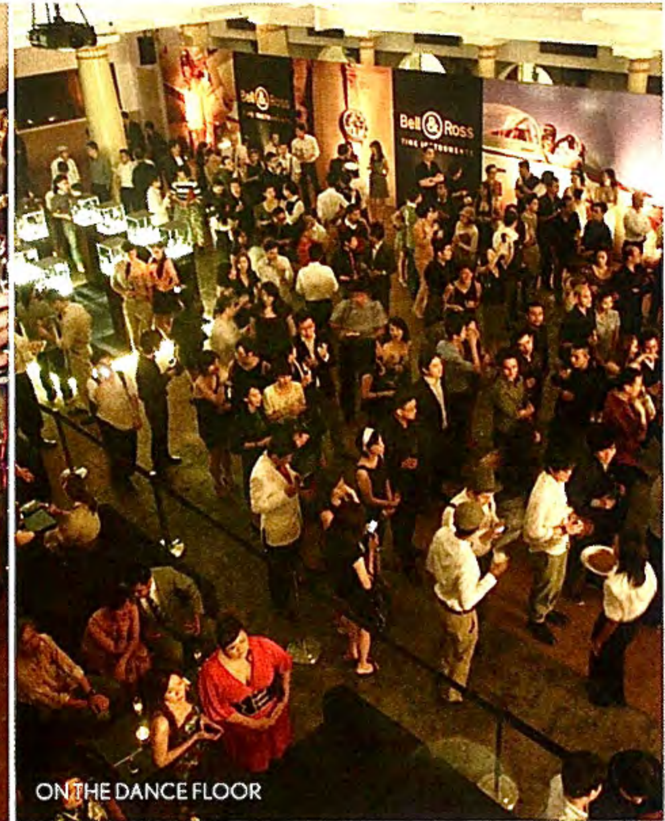
ON THE DANCE FLOOR