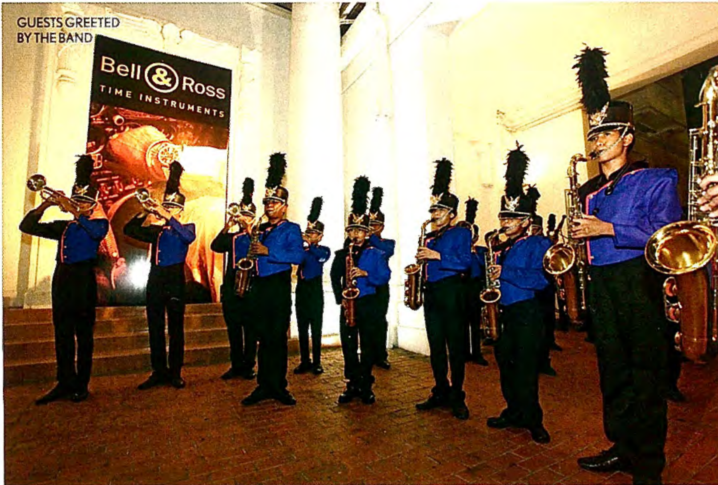
GUESTS GREETED BY THE BAND